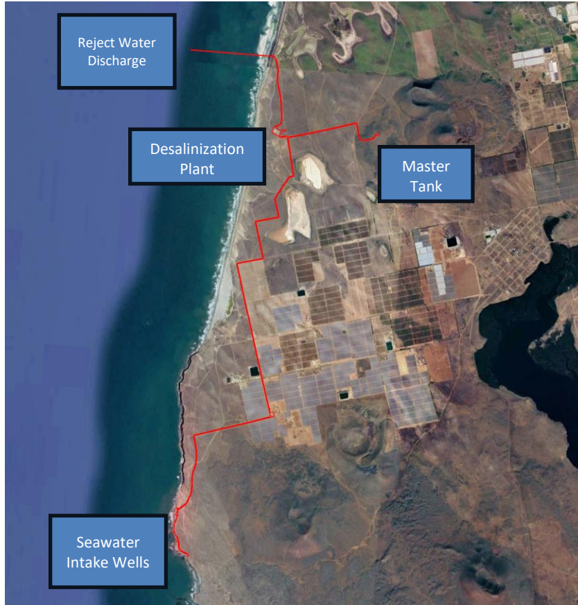
Figure 2 KEY PROJECT COMPONENTS

Overall, the wells will extract a volume of 600 lps of seawater, which will be conveyed to the desalination plant for treatment via an 8.4 km pipeline. The desalination plant will produce 250 lps of drinking water, as well as 350 lps of brine. The desalinated water will in turn be sent to the master tank via a 1.74 km pipeline for final storage and delivery to the distribution system. The brine will be discharged into the Pacific Ocean through the 2.37 km-long discharge line. It should be noted that the pipeline connecting the Master Tank to the distribution network will be implemented by the state government, which is currently surveying the existing distribution networks and developing projects for their expansion and improvements. This connection line is part of the first phase of the macro-distribution system under the Comprehensive Action Plan for San Quintín. The final design for this macro-distribution system is already complete. Construction of the first phase is estimated to begin in 2026 and conclude in 2027, before the project becomes operational.